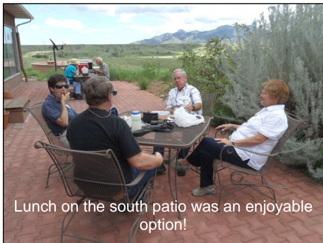
Lunch on the south patio was an enjoyable option!

Huachuca water umbel (HWU) is an endangered wetland species endemic to southeastern Arizona and little is known about the species' ecology. Using greenhouse-propagated material, we introduced 128 individual HWU plugs into four spring-fed wetland sites with a range of habitat conditions at Findley Tank, Audubon Research Ranch. After two years, overall survival of transplanted plugs was 60% and the area occupied had increased by 845%. We also examined the number of viable seeds incorporated into a seedbank at the study location in the first season after transplanting. This case study offers a model for watershed-wide reintroduction efforts of this endangered plant. The study also illustrates the importance of low level disturbance and the necessity of long-term monitoring and maintenance of competing plant species in establishing viable species reintroductions.